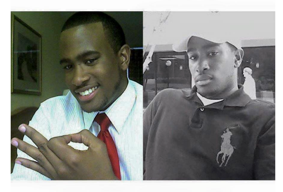
JUNE 9, 1988 - FEBRUARY 3, 2012