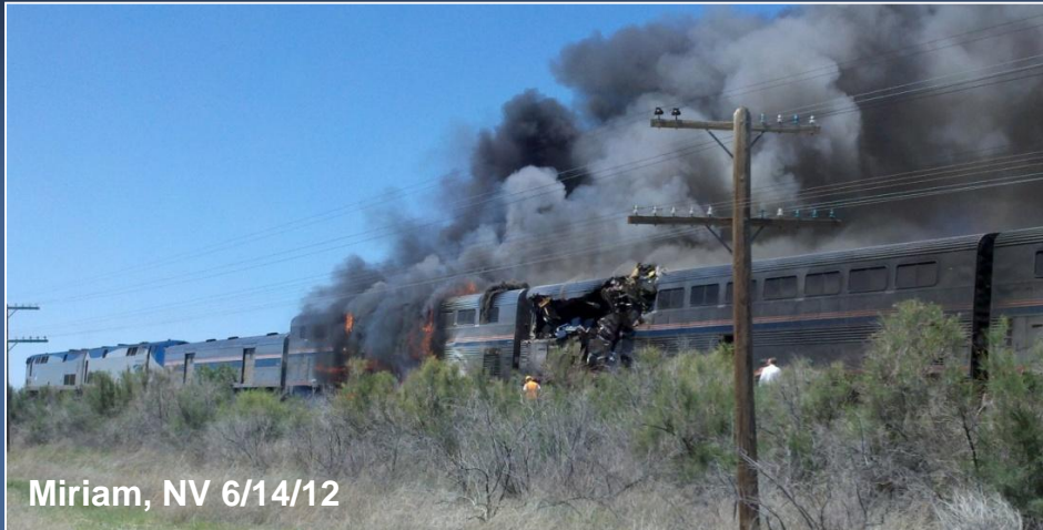
Miriam, NV 6/14/12