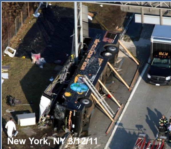
New York, NY 3/12/11