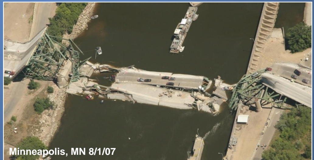
Minneapolis, MN 8/1/07