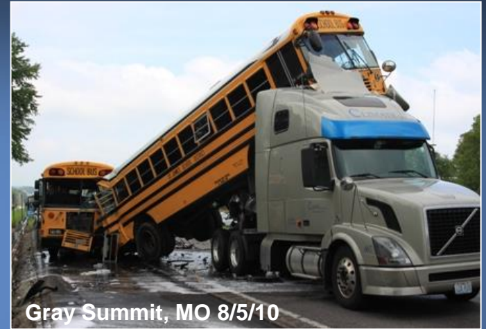
Gray Summit, MO 8/5/10